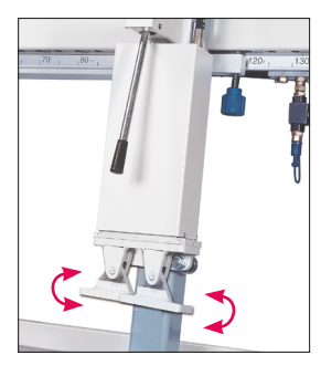
Pivoting thrust feet for tilted frames.