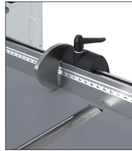
Manual side stop 60 mm (optional).